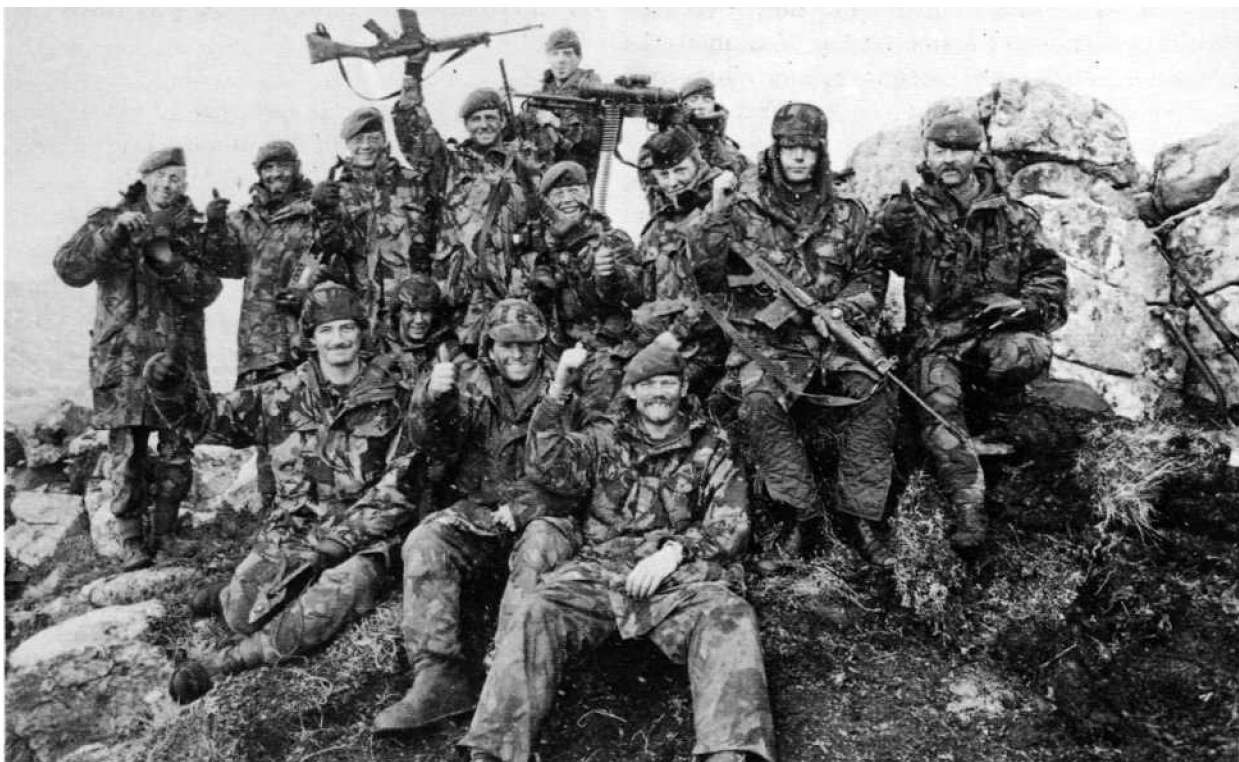
'It's all over!' Jocks of 7 Platoon, G Coy., 2SG hear the news of victory on 14 June. This battle-stained group display an amazing miscellany of clothing and equipment: second right wears the quilted trousers worn under the CW suit; beside him is a soldier—a piper?—in a Glengarry; behind him is the GPMG number with IWS fitted, probably the most effective use for this device.