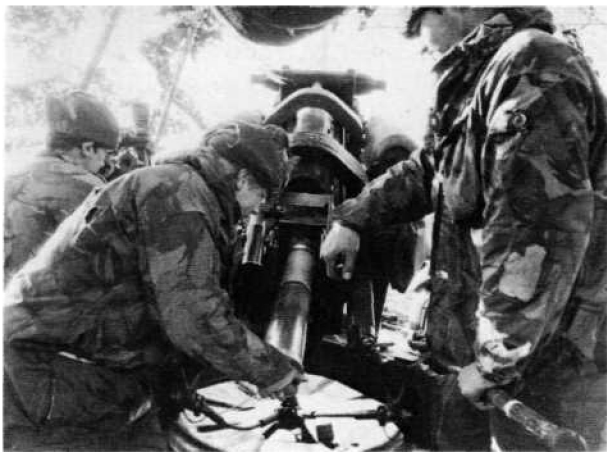
9 June, between Bluff Cove and Fitzroy: a 105mm light gun crew of C Sub., 29 'Corunna' Bty., 4 Field Regt. RA prepare to send on its way to Sapper Hill one of the 2,400 rounds fired during the final advance on Stanley.