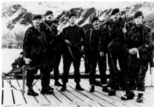
Men of 42 Commando, Royal Marines at Grytviken. M Company-'The Mighty Munch'-recaptured South Georgia alongside men of D Sqn., 22 SAS Regt. on 25 April.

In Britain there was considerable national anger at the invasion. Apart from the humiliation of seeing Royal Marines marched off as prisoners, there were the transmitted voices of the islanders: part West