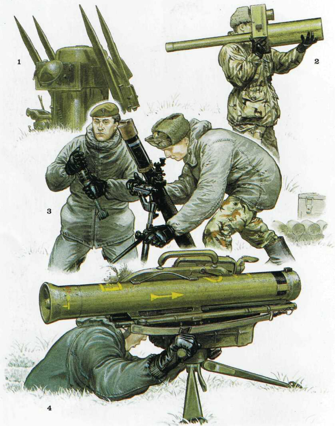
1: Rapier SAM 2: Blowpipe SAM 3: 81mm mortar, 1st Bn. Welsh Guards 4: Milan, 1st Bn., 7th Gurkha Rifles