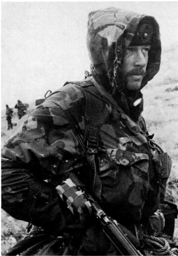
A Royal Marine, impressively clean-shaven, photographed in blowing snow during the final phase of operations before Stanley. Note first field dressings taped to both SLR butt and belt—all bullets have an exit as well as an entry hole ... Hoods were only worn up when out of the line and in danger of frostbite: in action they are bad for the hearing, which can be fatal.

2 Para's route reported their movement, and Menendez heli-lifted his reserves from Mt. Challenger down to Goose Green and Darwin. Suddenly the garrison, estimated at 500 men mostly from the Air Force, was swollen to 1,400, good troops, dug in and alert.