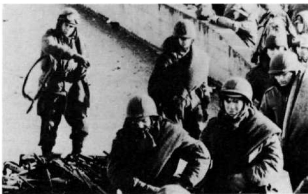
With an expressive gesture of disgust, an Argentine prisoner hurls down his rifle. The faces of his comrades tell their own story.

a small rectangular patch of the Argentine tricolour flag mid-way between left shoulder and elbow.