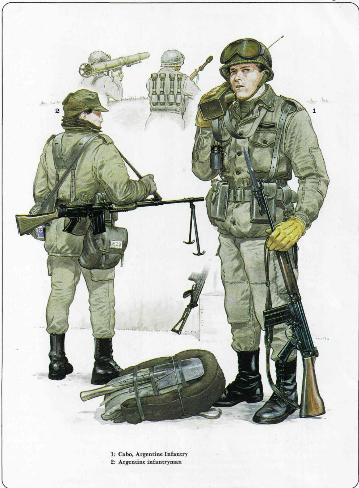
1: Cabo, Argentine Infantry 2: Argentine infantryman