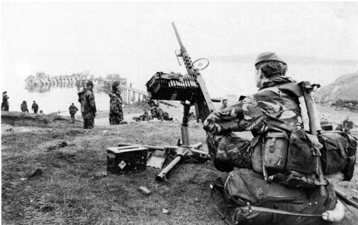
2 June: Guardsmen of 5 Inf.Bde. come ashore at San Carlos under the watchful eye of an AA sentry with a short-barrel Browning M2.50cal. machine gun. His CEFO includes the lightweight pick; and he is sitting on a rucksack of civilian origin.

to Montevideo (where, intriguingly, he is reported to have disappeared) when it was established that there was no provision of the Geneva Convention under which he could be questioned against his will by authorities of a third party.