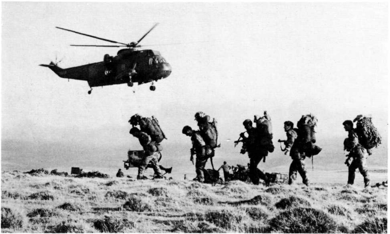
A Sea King lifts heavy equipment in the background as Guardsmen of 5 Bde. move inland through comrades digging in.

the Argentine mainland, whose cargo could be off-loaded there for onward shipment by smaller aircraft or the small ships which operated around the coasts. A cynic might also suggest that there was a need for good news after the loss of HMS Sheffield ; despite the claim that the Task Force had a free hand, there were moments when it seemed as if the Cabinet was asking them to deliver some good news.