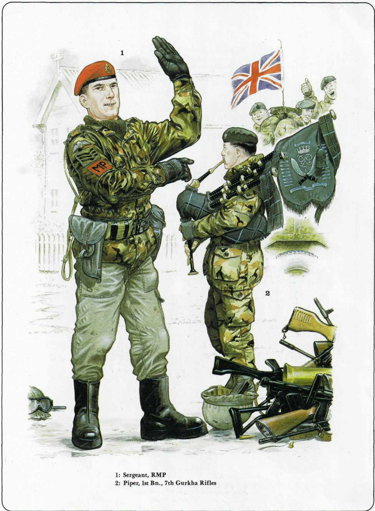
1: Sergeant, RMP 2: Piper, 1st Bn., 7th Gurkha Rifles