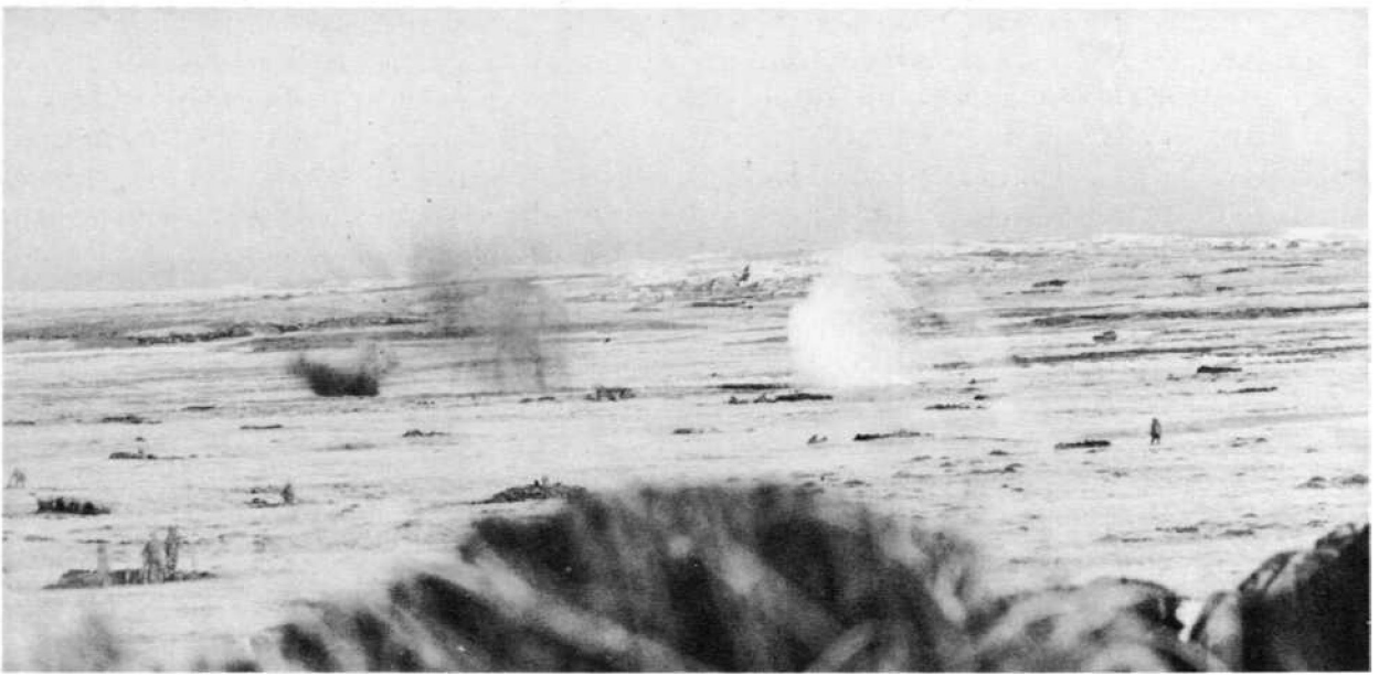
Enemy shells fall among 2nd Scots Guards as they dig in below Goat Ridge; the white burst is phosphorus.

down troublesome flies. With four men riding each Scout helicopter, the Gurkhas would put in parties of about a dozen men to attack suspected OPs, covered by Gazelles with SNEB rockets. This efficient technique netted an enemy party from West Falkland armed with SAM-7 missiles.