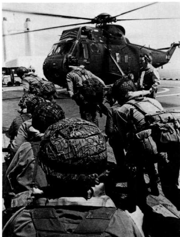
3 Para practising helicopter drill with Sea Kings on the SS Canberra during the Task Force's voyage south; they wear life jackets and '58 pattern CEFO. Helmet camouflage is to personal taste.

A causis belli was engineered by the planting of a party of supposed 'scrap merchants' on South Georgia, whose ostensibly innocent presence was compromised by the raising of the Argentine flag, and the tiny Royal Marine force despatched 22 men to South Georgia's port of Grytviken to keep an eye on the Argentine party at Leith. It was at this point in what seemed a trivial dispute that, on the night of 1/2 April 1982, the Junta led by Gen. Leopoldo Galtieri made its move. On 3 April British Prime Minister Mrs. Margaret Thatcher faced an appalled and furious House of Commons to announce that Argentine armed forces had landed on British sovereign territory; had captured the men of Royal Marine detachment NP8901; had run up