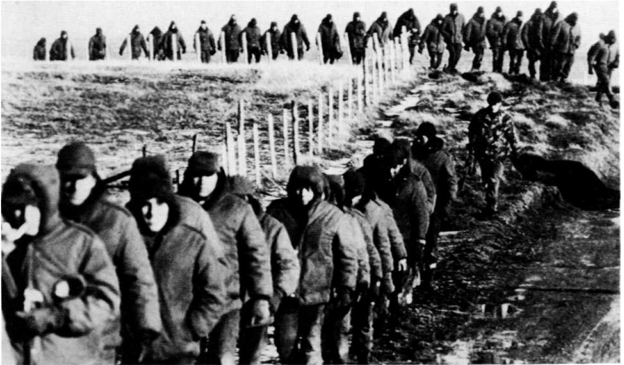
Some of the 1,200-odd Argentine prisoners taken at Goose Green are marched off to the 'cage', 29 May; their winter parkas, made in Israel, gave inferior protection to the range of layered clothing worn by the Task Force, and some probably came from northern areas and so had great difficulty acclimatising to the freezing Falklands winter.

The conclusions drawn by Sotero's staff were that the main threat was from night attacks; and that helicopters, the key to mobility, were therefore a priority target. They were able to say (on 17 April) that the helicopters would be carried aboard a container ship. They felt that the direct assault option would be too costly in lives; and that the indirect approach would be too slow, as the USA and USSR would put a stop to the fighting by political pressure. However, their assessment of the pre-landing operations was entirely correct: