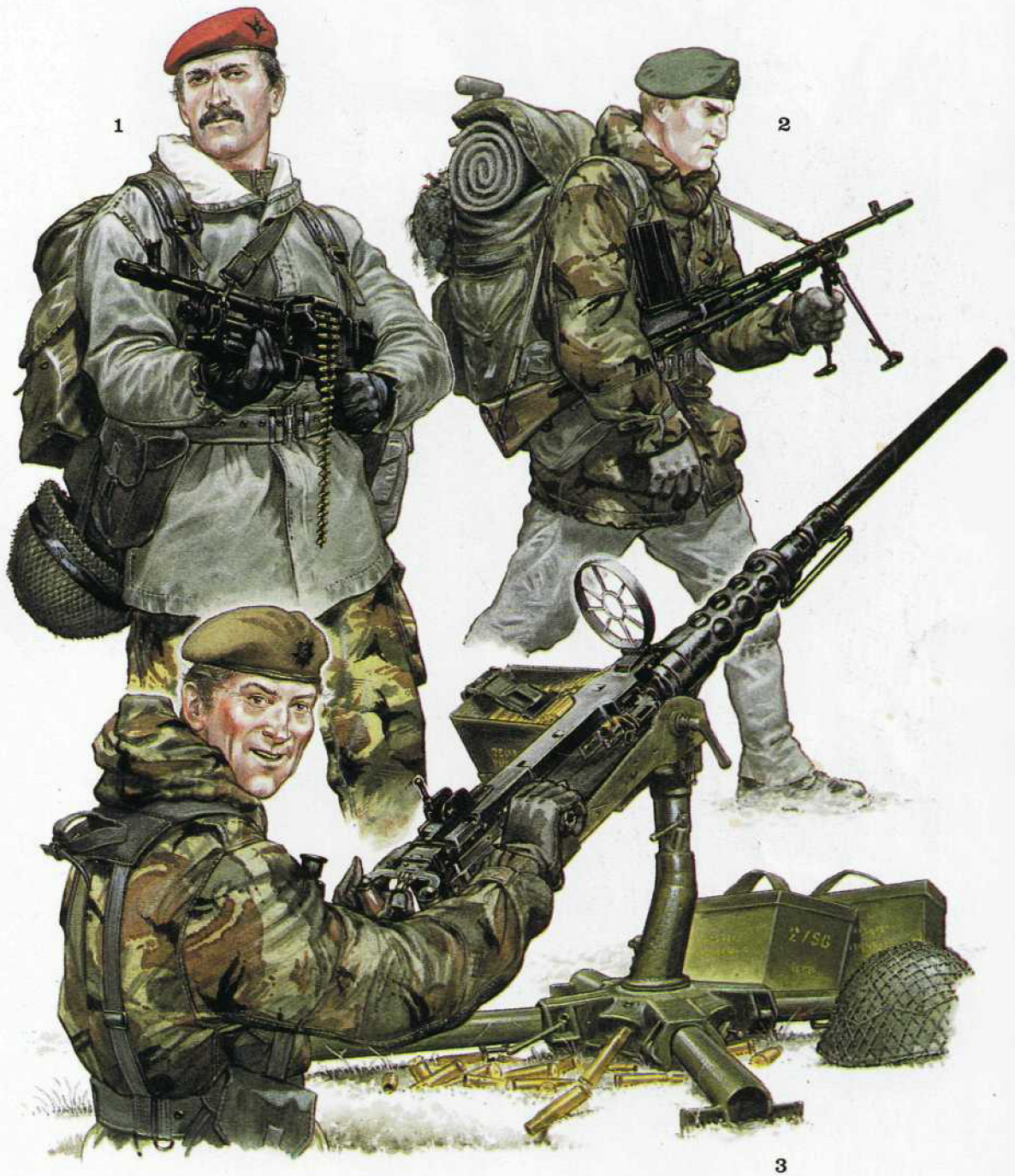
1: GPMG, 3rd Bn. Parachute Regt. 2: LMG, Royal Marine Commandos 3: .50 cal.MG, 2nd Bn. Scots Guards