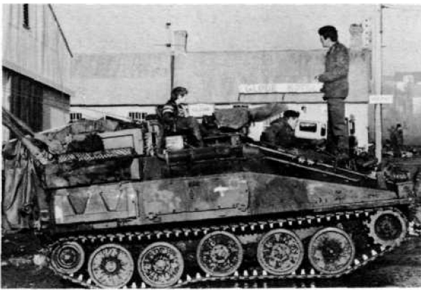
A local boy is given a ride on the Blues and Royals' Samson ARV.

has an HE warhead. Blowpipe's weight is 47lbs., its length 4ft. 7ins. An estimated nine aircraft fell to this weapon in the Falklands. Here the operator wears standard CW suit and cap.