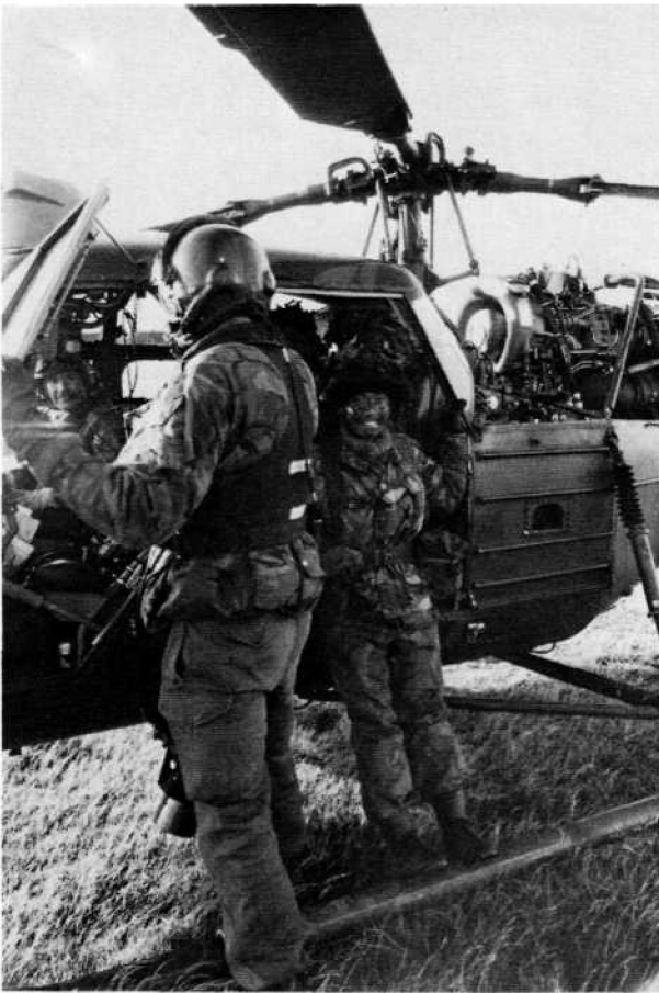
Gurkhas prepare to take off from Darwin to clear enemy OPs in the hills, 5 June. Four soldiers rode in each Scout, with feet braced on the skid.

through the darkness from HMS Intrepid and Fearless while the guns of the frigates and destroyers began to soften up targets ashore. On Fanning Head a troop of Argentines were routed by the SBS in a fierce firefight. The LCMs beached, and the Scorpions and Scimitars of the Blues and Royals were first down the ramps to give supporting fire. By 0730 the landings by 40 Cdo. and 2 Para on Blue Beaches 1 and 2 were complete. As the dawn rose 45 Cdo. came ashore at Red Beach in Ajax Bay, and 3 Para, followed by 42 Cdo. in reserve, at Green Beaches 1 and 2 close to San Carlos Settlement.